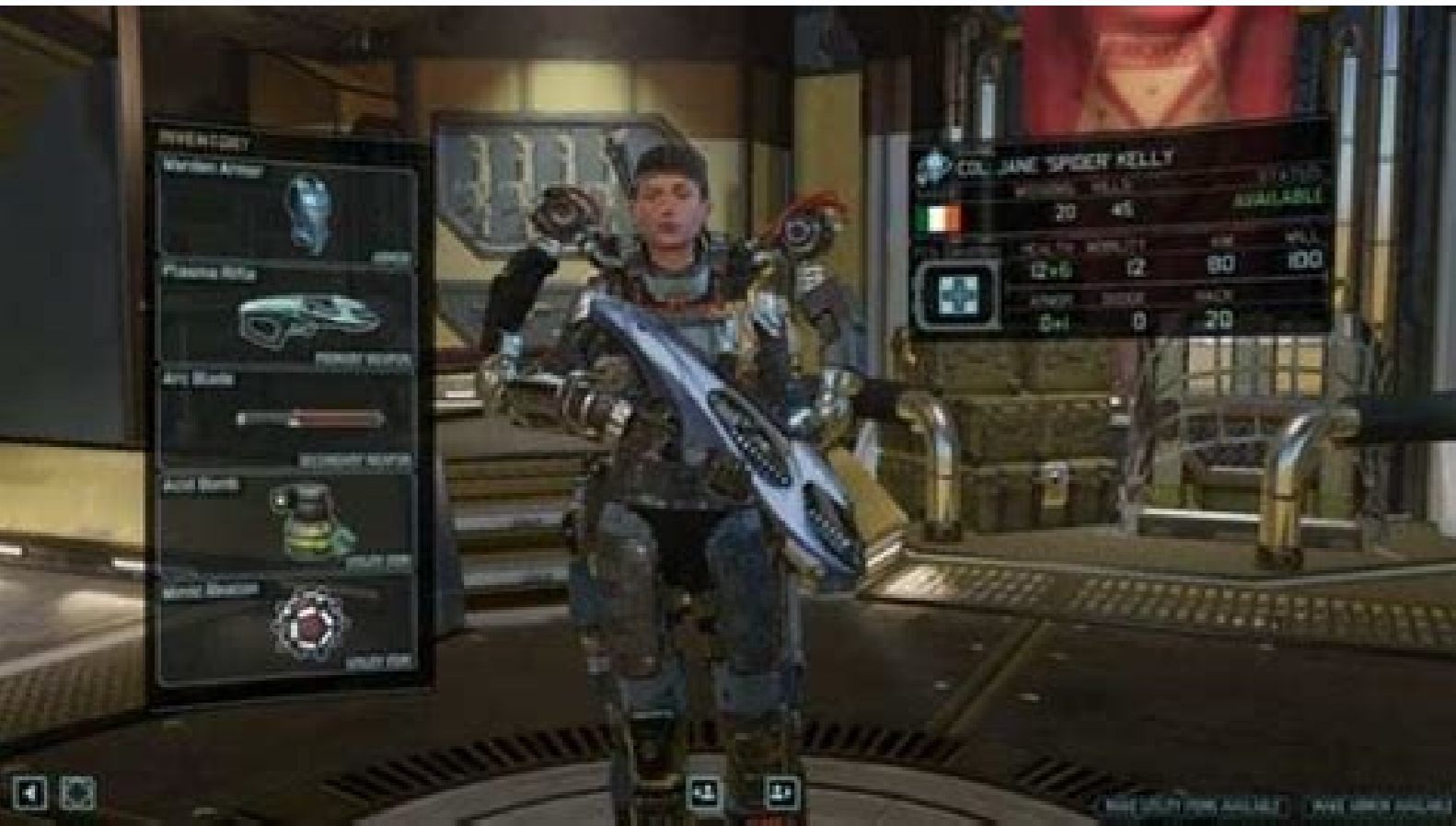
Xcom 2 armor list. Xcom 2 armor mods.